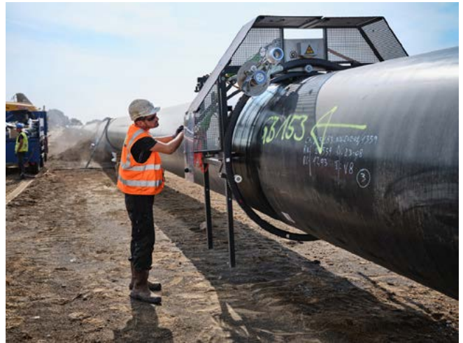
DEKOTEC GmbH: Efficient application with DEKOMAT®-11.

Surface preparation is possibly the most important step taken during the coating process to ensure the success of the coating system. Improper or poor surface preparation can be immediately detrimental to a coating system, or it can be the reason that the coating fails over time. Blast cleanliness and anchor profile are key to the actual surface preparation. They are both performed to a standard