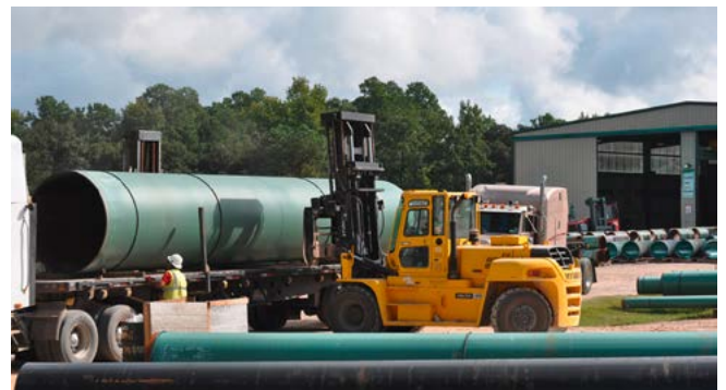
L.B. Foster: The Texas facility can coat 1/4 in. up to 74 in. pipe, as well as induction bends, forged fittings, tees, pups and spool pieces, all on one site with numerous coating options.