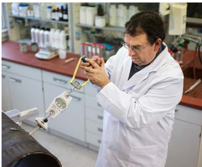
DEKOTEC GmbH: Peeling test of a 40-year old pipe.

Barrier coatings simply slow down the corrosion process by getting between the protected material and the electrolyte (ground, saltwater, etc.). Metals corrode according to the galvanic series – with more easily corroded materials at the top and less corrosive, often referred to as noble, materials at the bottom. When using a sacrificial coating, the coating that is applied is much higher in the galvanic series than the metal that it is chosen to protect and will corrode first or sacrifice itself. In acting as one of these protections, coatings provide corrosion resistance.