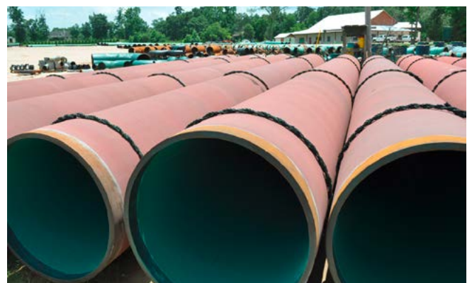
L.B. Foster: The company's variety of coating solutions includes FBE, Specialty Polymer Coatings, Denso Protal, and Seal for Life Powercrete.