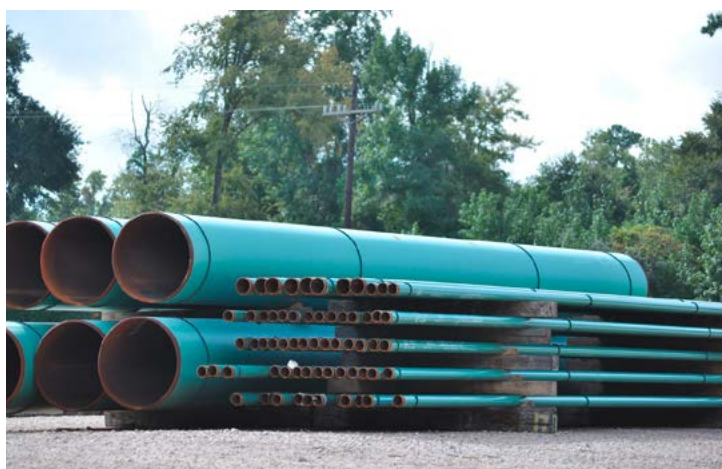
L.B. Foster: L.B. Foster Protective Coatings Willis, Texas facility is designed to provide versatility, speed, quality and experience to custom coating applications.

well can fail if it is in a service condition that it is not designed for. This might be a function of temperature, immersion