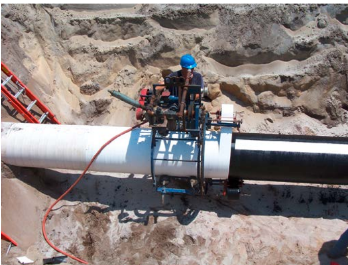
Seal For Life Industries: Pipeline CAT rehabilitation.

on the field from moisture can be easily achieved by using adequate enclosures.