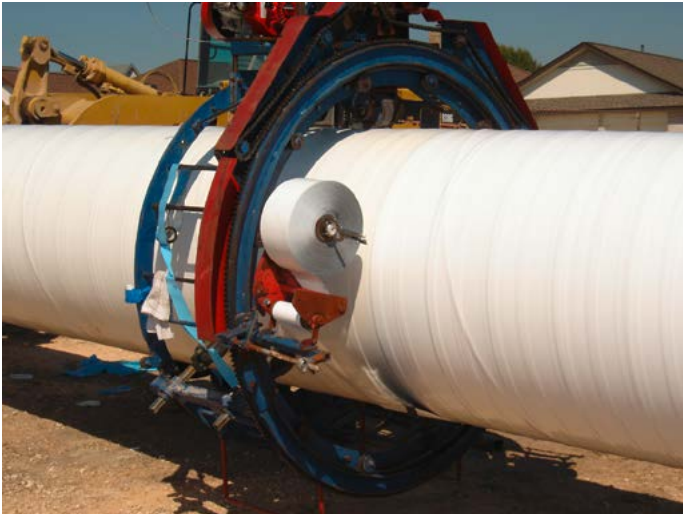
Seal For Life Industries: Pipeline CAT coating.

A MICHAEL SCHAD & LUC PERRAD, DEKOTEC GmbH Surface preparation is critical to ensure a coating's performance (mainly adhesion). Protecting the steel surface